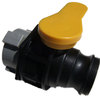
Fits Greif and Mauser IBCs